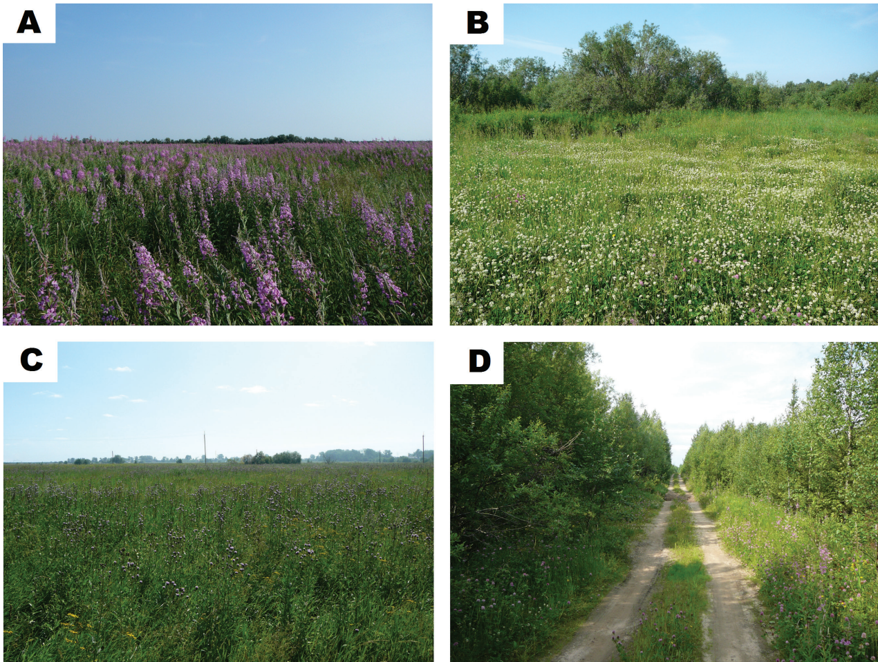
Fig. 2. Typical foraging habitats for bumblebees in the lower reaches of the Northern Dvina River. (A) Ruderal communities with Epilobium angustifolium . (B) Meadow with Trifolium repens . (C) Meadow with Cirsium arvense . (D) Roadsides alongside the forest.

2016 by the researchers M.V. Podbolotskaya, I.N. Bolotov, B.Yu. Filippov, Yu.S. Kolosova and G.S. Potapov.