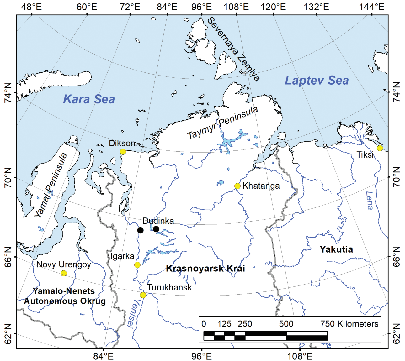
Fig. 1. Map of the Southern Taymyr. Black circles indicate the studied localities